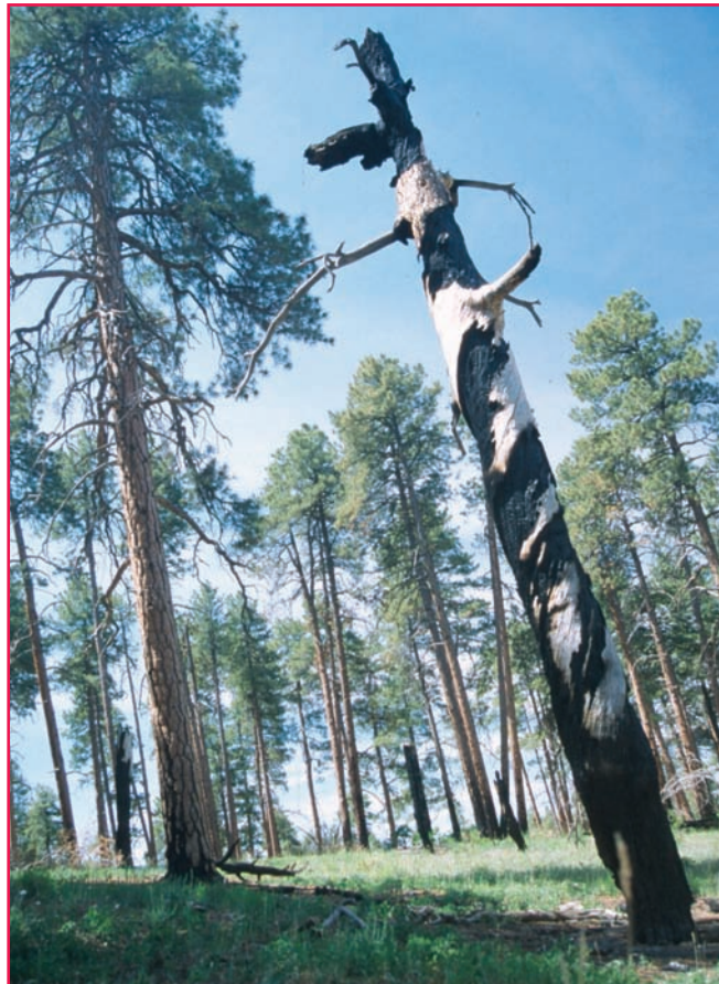
Old-growth ponderosa pine trees and standing snag on the recently burned Powell Plateau, Grand Canyon National Park. Photo: D. Laughlin, 2004.

of acres of unharvested old-growth forests that range from open ponderosa pine groves to dense spruce-fir-aspen stands. These stands provide researchers a unique setting to study the role of fire in forested ecosystems.