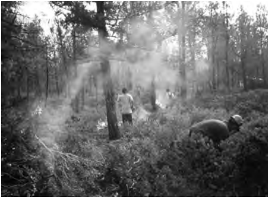
A fuel-reduction project in a fire-adapted, Jeffrey pine ( Pinus jeffreyi ) savanna on Rough and Ready Creek in southwestern Oregon. The project, which was organized by the Lomakatsi Restoration Project of Ashland, Oregon, includes small-tree thinning, lower-branch pruning, and brush pile burning. The project makes use of National Fire Plan funds for small tree and brush removal.

precedence where it is vital to eliminate or reduce the root causes of ecosystem degradation, including stopping destructive logging, road building, livestock grazing, mining, building of dams and water diversions, off-road vehicle use, and alteration of fire regimes (Appendix 1). Passive restoration can be applied alone or in combination with active restoration techniques provided that the primary goal is to stop the degradation and restore ecological integrity.