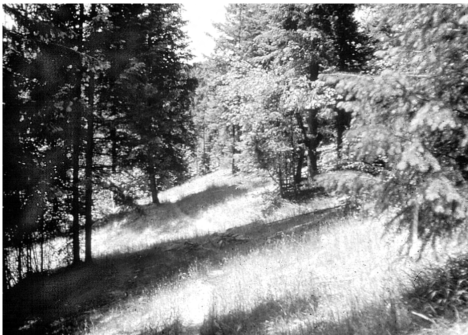
Road recontouring (middle of photo) along Grass Valley Creek in Redwood National Park, northern California, one year after project completion. The removal of roads and recontouring of slopes helps restore hydrological processes and aquatic health while reducing the effects of forest fragmentation.

Restoration must foster a sustainable human relationship to the land that promotes ecological integrity, social and economic justice for workers and communities, and a culture of preservation and restoration. In turn, effective restoration depends on strong, healthy and diverse communities and a skilled, committed work force. While the restoration principles provide the “ecological horse” for steering such an approach, the “economic cart” generated