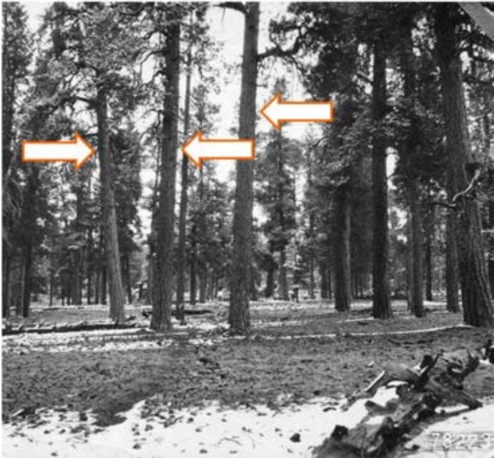
Figure 1a 37

The use of repeat photography allows us to see the changes in forest structure over time. Note the open forest structure in this photograph from 1909.